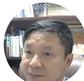
Mr. Le Ngoc Tuan Director General of International Cooperation Department, Ministry of Natural Resources and Environment, Vietnam

Humanity currently faces the crisis of climate change, environmental pollution, and biodiversity loss, and these issues need to be resolved with a global approach. Vietnam welcomes the formulation of the New Strategy and Action Framework and believes that under the guidance of the priority areas for the cooperation of the New Strategy and Action Framework, each member country will enhance capacity building in the areas of climate change mitigation and adaptation, clean energy transformation, and sustainable infrastructure. and promote sustainable development in the region.