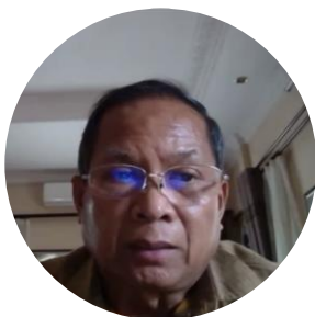
Mr. Lonkham Atsanavong Director General of Natural Resources and Environment Research Institute Ministry of Natural Resources and Environment, Laos

Humanity currently faces the crisis of climate change, environmental pollution, and biodiversity loss, and these issues need to be resolved with a global approach. Vietnam welcomes the formulation of the New Strategy and Action Framework and believes that under the guidance of the priority areas for the cooperation of the New Strategy and Action Framework, each member country will enhance capacity building in the areas of climate change mitigation and adaptation, clean energy transformation, and sustainable infrastructure. and promote sustainable development in the region.