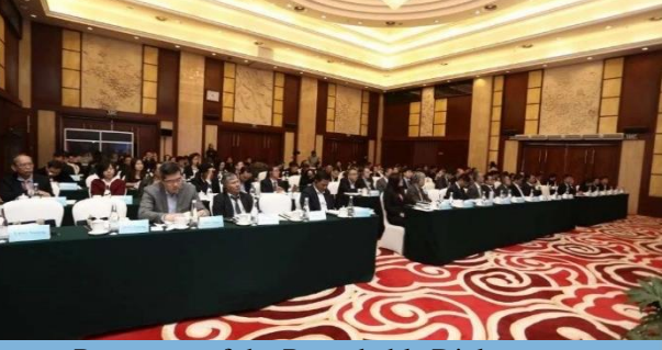
Panorama of the Roundtable Dialogue