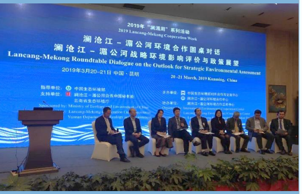
The Comments and Discussion Session