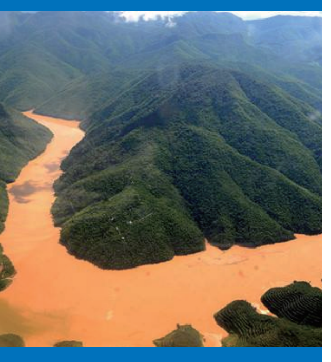
The Lancang-Mekong River

The Lancang-Mekong River, with length of 4880 km and total area of 810,000 square kilometers, is the sixth largest river of the world. The part in the territory of China is called Lancang River, with length of 2198 km.