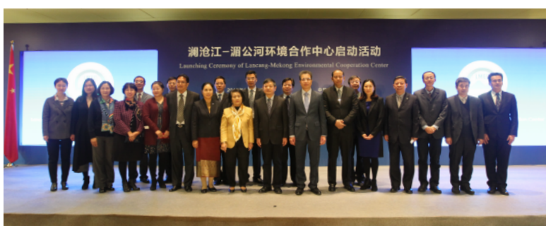
Group photo of the delegations from Lancang-Mekong countries

Ambassadors to China from Cambodia, Laos and Viet Nam, Ministers from Thai Embassy and Myanmar Embassy in China, representatives from Ministry of Foreign Affairs, National Development and Reform Commission, Ministry of Water Resources, Ministry of Commerce, Chinese People's Association for Friendship with Foreign Countries and Lancang-Mekong Water Resources Cooperation Center attended the launching ceremony.